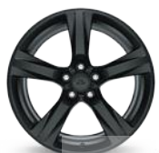
5-Spoke Low-Gloss Black Aluminum 20" x 8.5" Front and 20" x 9.5" Rear on SS 4 20" x 8.5" Front and Rear on LT