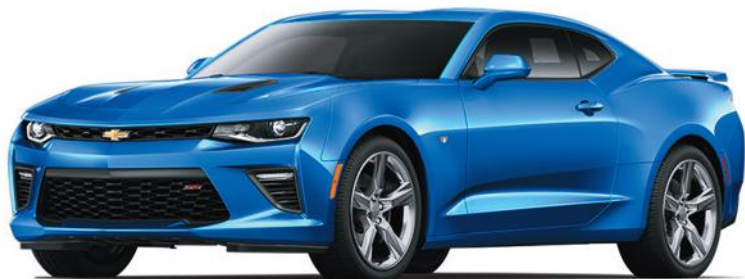
HYPER BLUE METALLIC 1