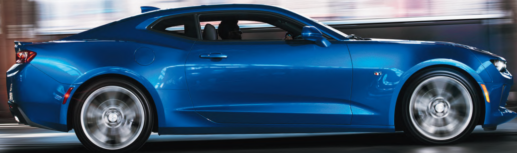
Camaro LT Coupe in Hyper Blue Metallic with available RS Package.

The Chevrolet Camaro DNA will never change. We promise you that. But everything else about this sixth-generation icon was redesigned in the name of performance.