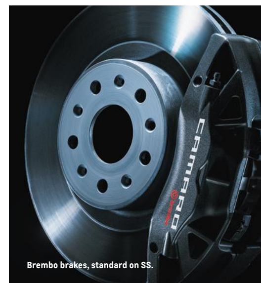
Brembo brakes, standard on SS.