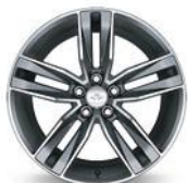
5-Split-Spoke Premium Gray-Painted Machined-Face Aluminum 20" x 8.5" Front and 20" x 9.5" Rear on SS 4 20" x 8.5" Front and Rear on LT 5