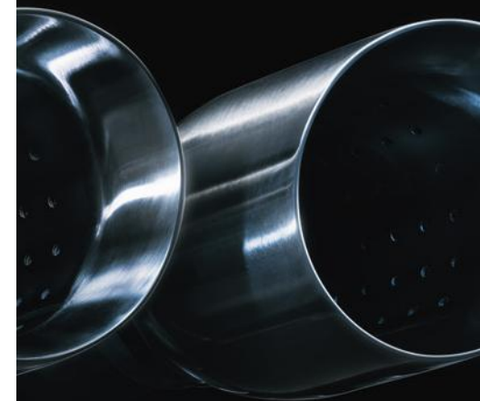
Available dual-mode exhaust.