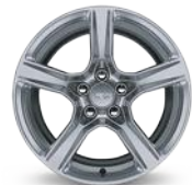
Silver-Painted Aluminum 18" x 8.5" Front and Rear on LT