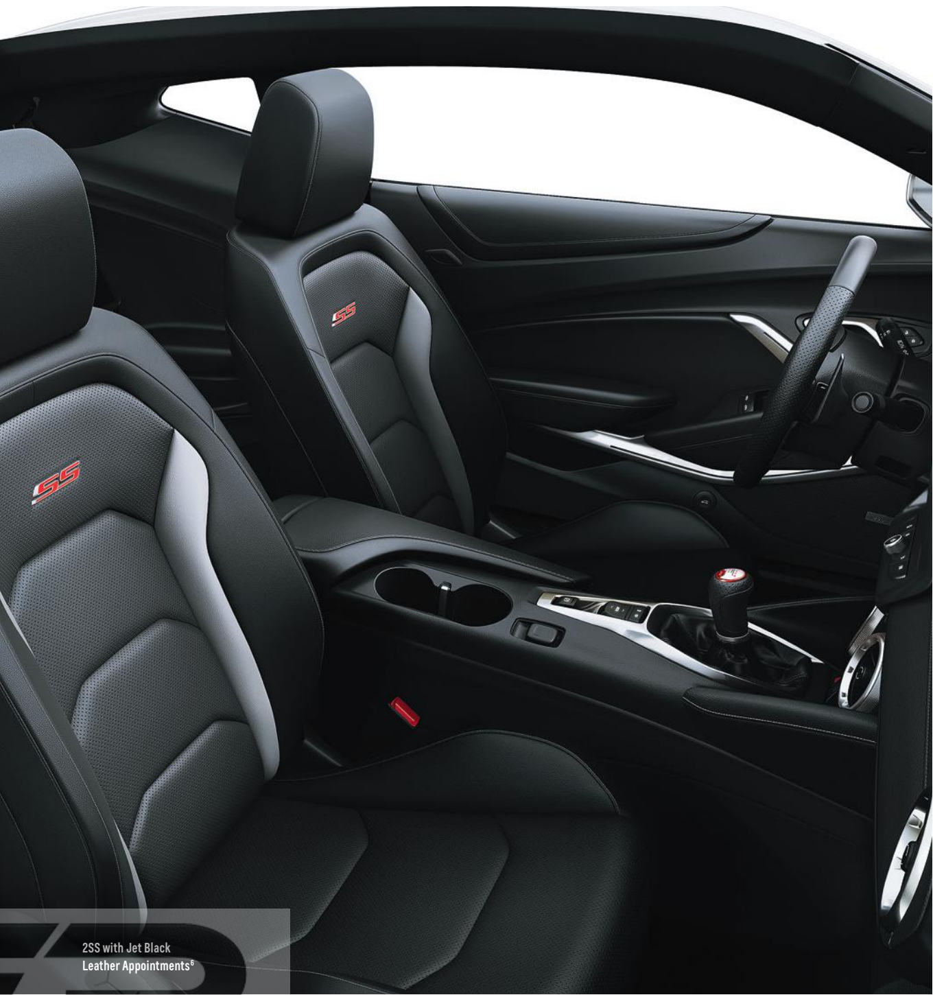
2SS with Jet Black Leather Appointments 8