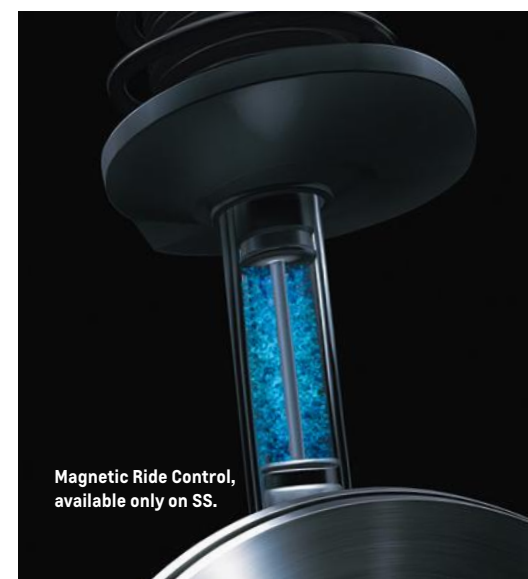
Magnetic Ride Control, available only on SS.