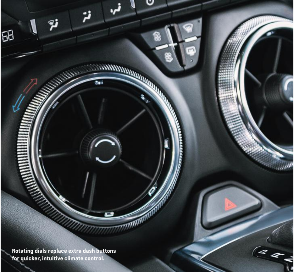
Rotating dials replace extra dash buttons for quicker, intuitive climate control.