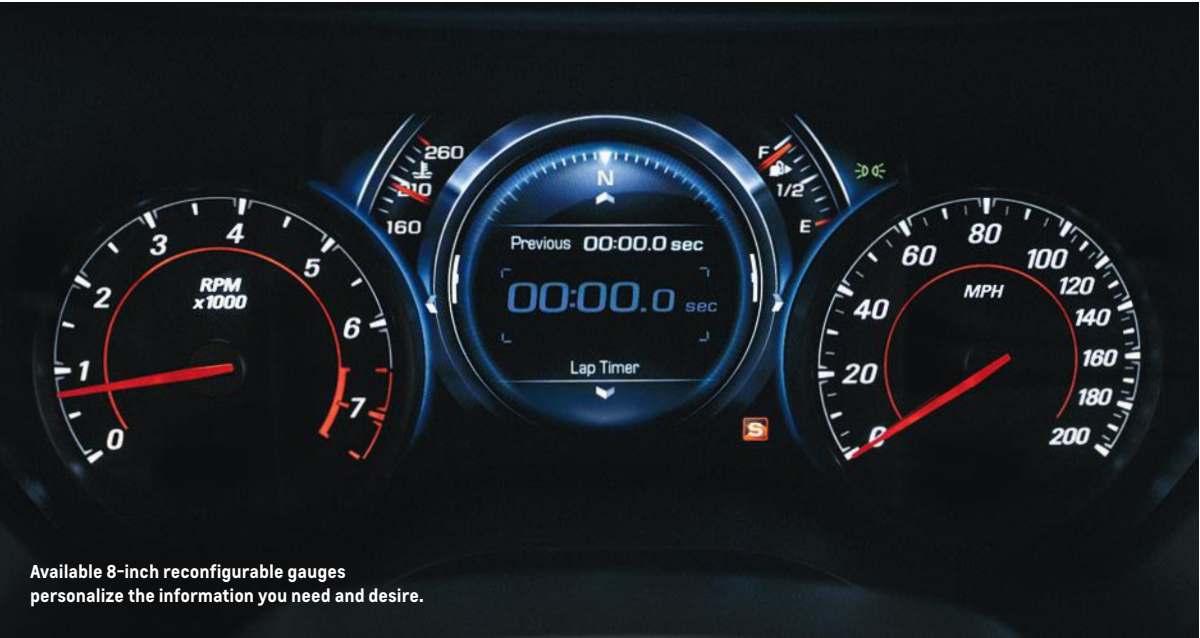
Available 8-inch reconfigurable gauges personalize the information you need and desire.