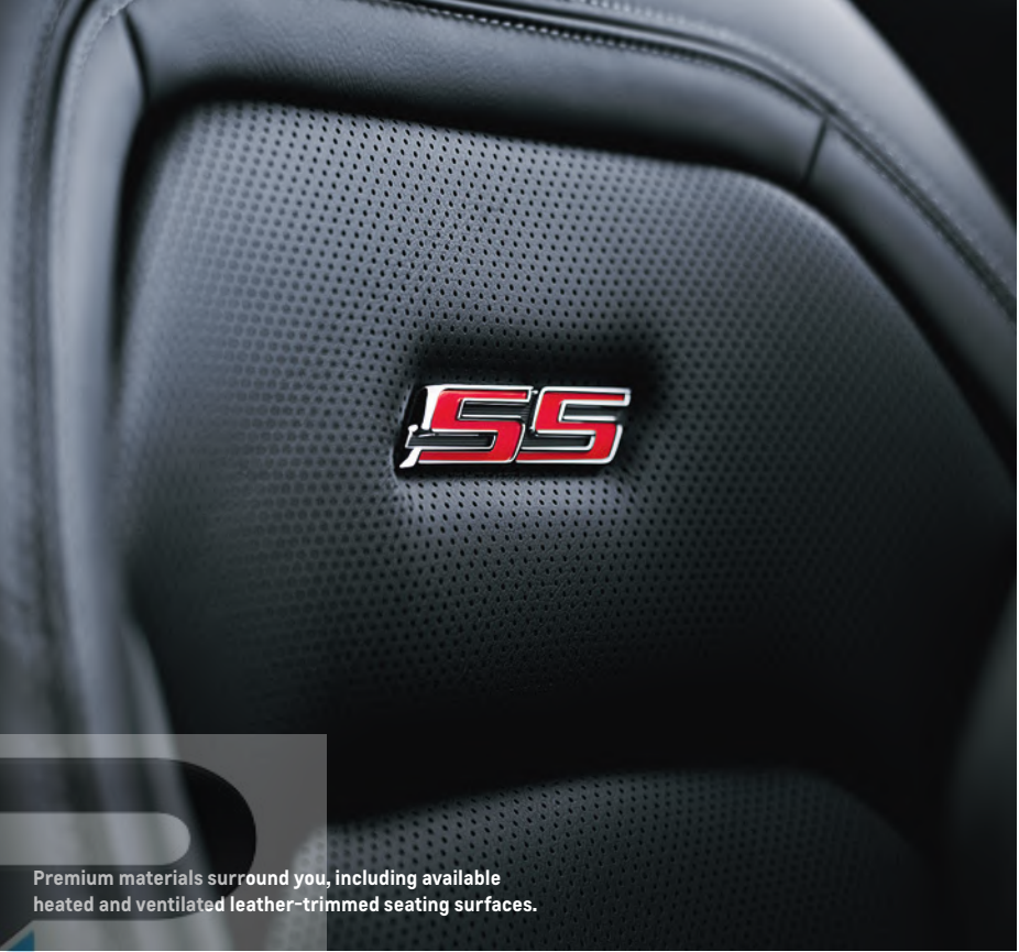
Premium materials surround you, including available heated and ventilated leather-trimmed seating surfaces.