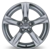
5-Spoke Bright Silver-Painted Aluminum 20" x 8.5" Front and 20" x 9.5" Rear on SS 4