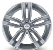
5-Split-Spoke Bright Silver-Painted Aluminum 20" x 8.5" Front and 20" x 9.5" Rear on SS 4 20" x 8.5" Front and Rear on LT 5