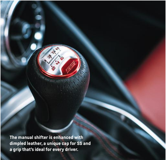
The manual shifter is enhanced with dimpled leather, a unique cap for SS and a grip that's ideal for every driver.